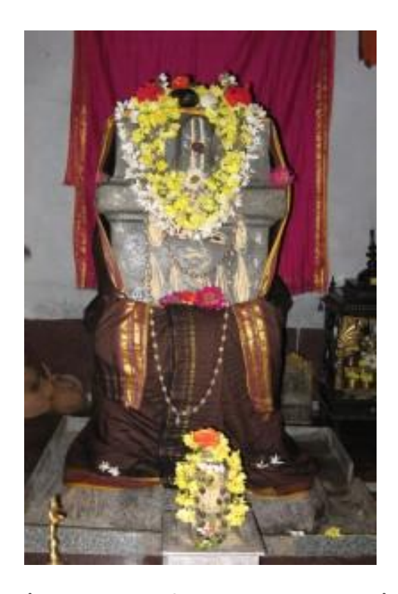
(Swapna Vrundavana, Lingasugooru)