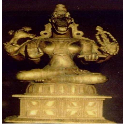
Hayagreeva Idol (Hayagreeva Devaru)

Once a goldsmith was melting a metal for making an idol of Ganapathi. The goldsmith tried and tried but could not do so even after several attempts. Each it was becoming an idol of Hayagreeva icon. That night the goldsmith was instructed in his dream to hand over the idol to Vaadirajaru. Similarly Vaadirajaru also received a dream wherein he was instructed to receive the Hayagreeva idol from the Goldsmith. Next day, the goldsmith went to Sri Vadirajaru and offered the Hayagreeva idol. Subsequently, the entire group of the goldsmith community from that region was provided with Chakrakana and were brought under Sonda Mutt.