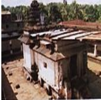
Rama Trivikrama Temple

Devaru placed in a big chariot with only 3 wheels and one wheel missing in Sonda.