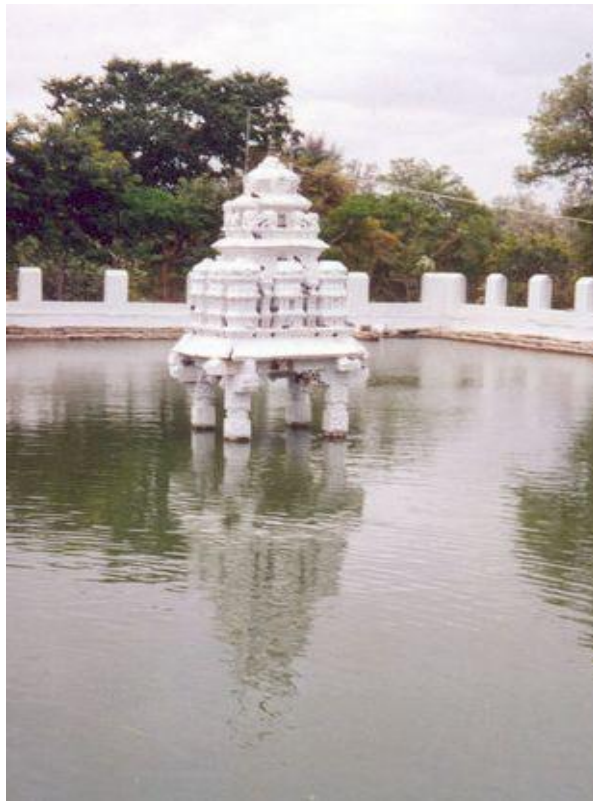
Ratha @ Narasimha Theertha